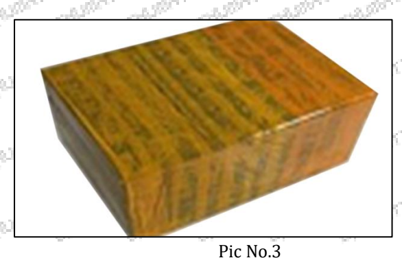
International express packaging: Wrapped with yellow tape after wrapping black protective film

Mob/Whatsapp: +86 13410541523 Tel: +8675523215133 Email: ruby@shumatt.com Website: www.shumatt.com