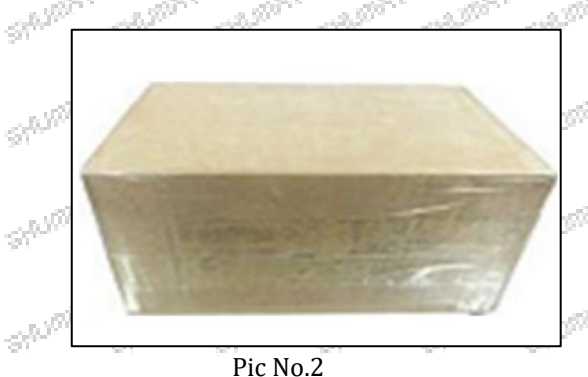
Domestic express packaging: Wrapped by Transparent tape

Minors are prohibited from using transparent tape, yellow tape, black wrapping protective film, and white wrapping protective film to avoid personal injury.